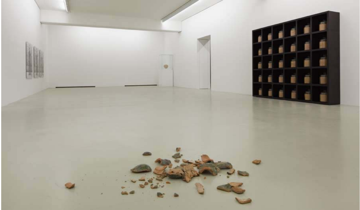
Barely Something Museum DKM, 2010