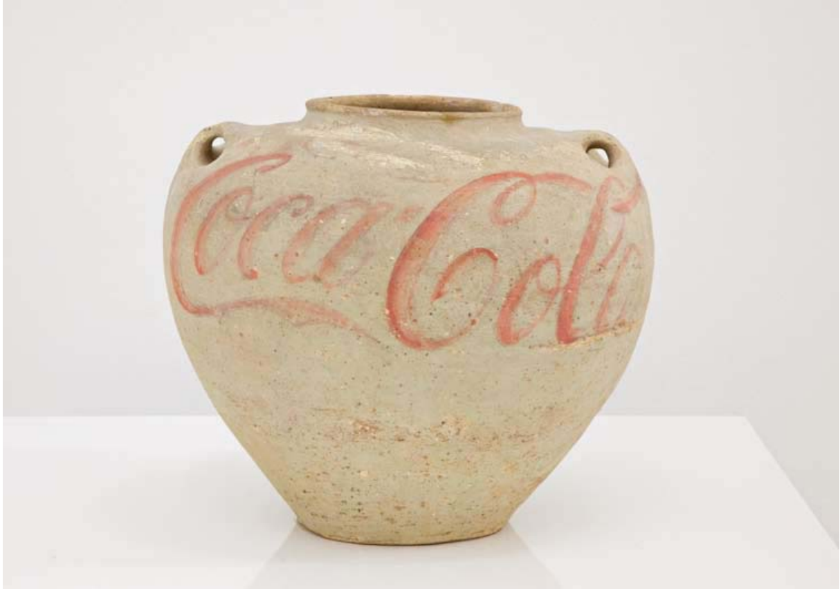
Han Dynasty Urn with Coca Cola Logo, 1994 Urn from Western Han-Dynasty (206 BC – 8 AD) and paint 25 x 28 x 28 cm Uli Sigg Collection Switzerland