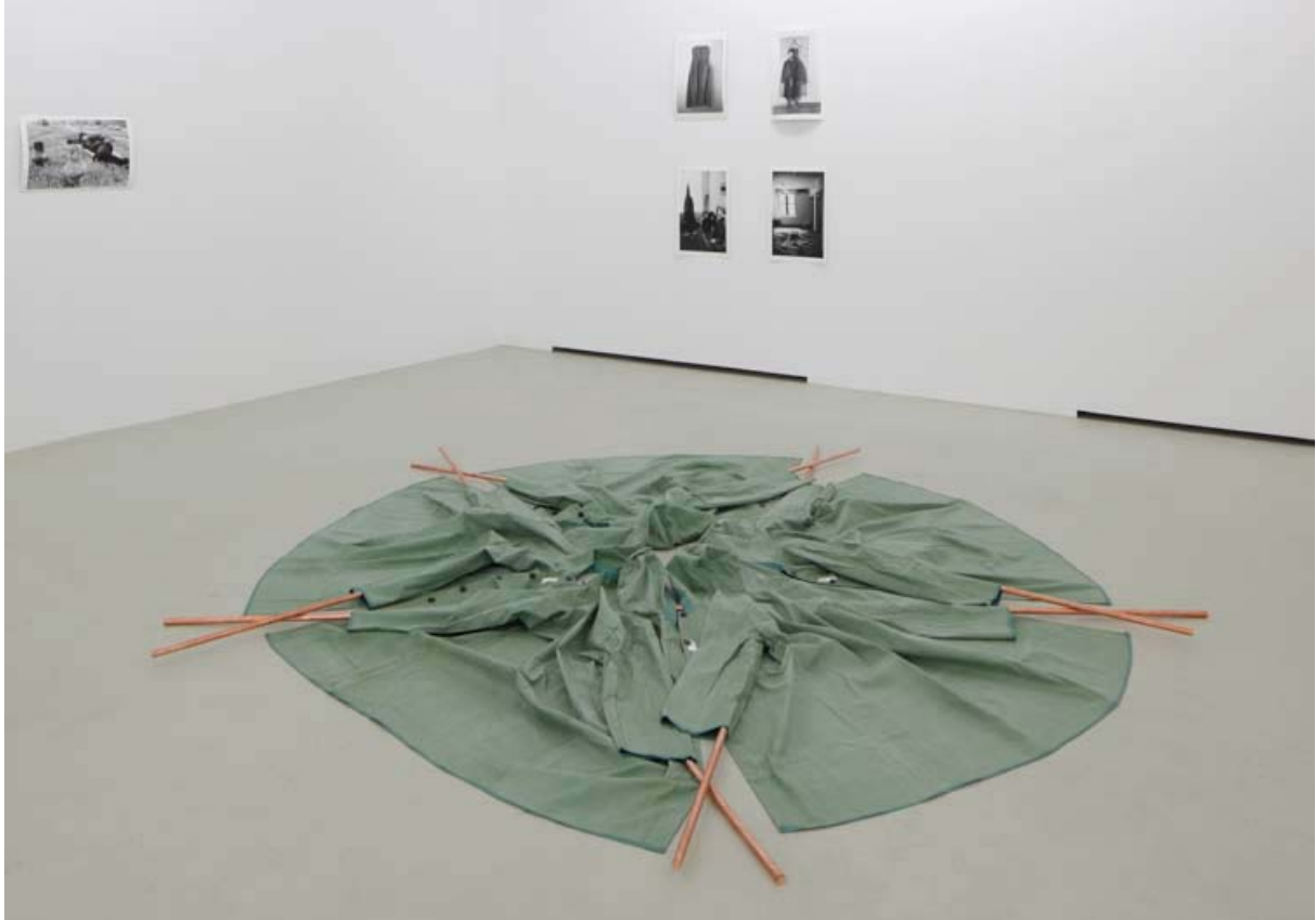
Barely Something Museum DKM, 2010